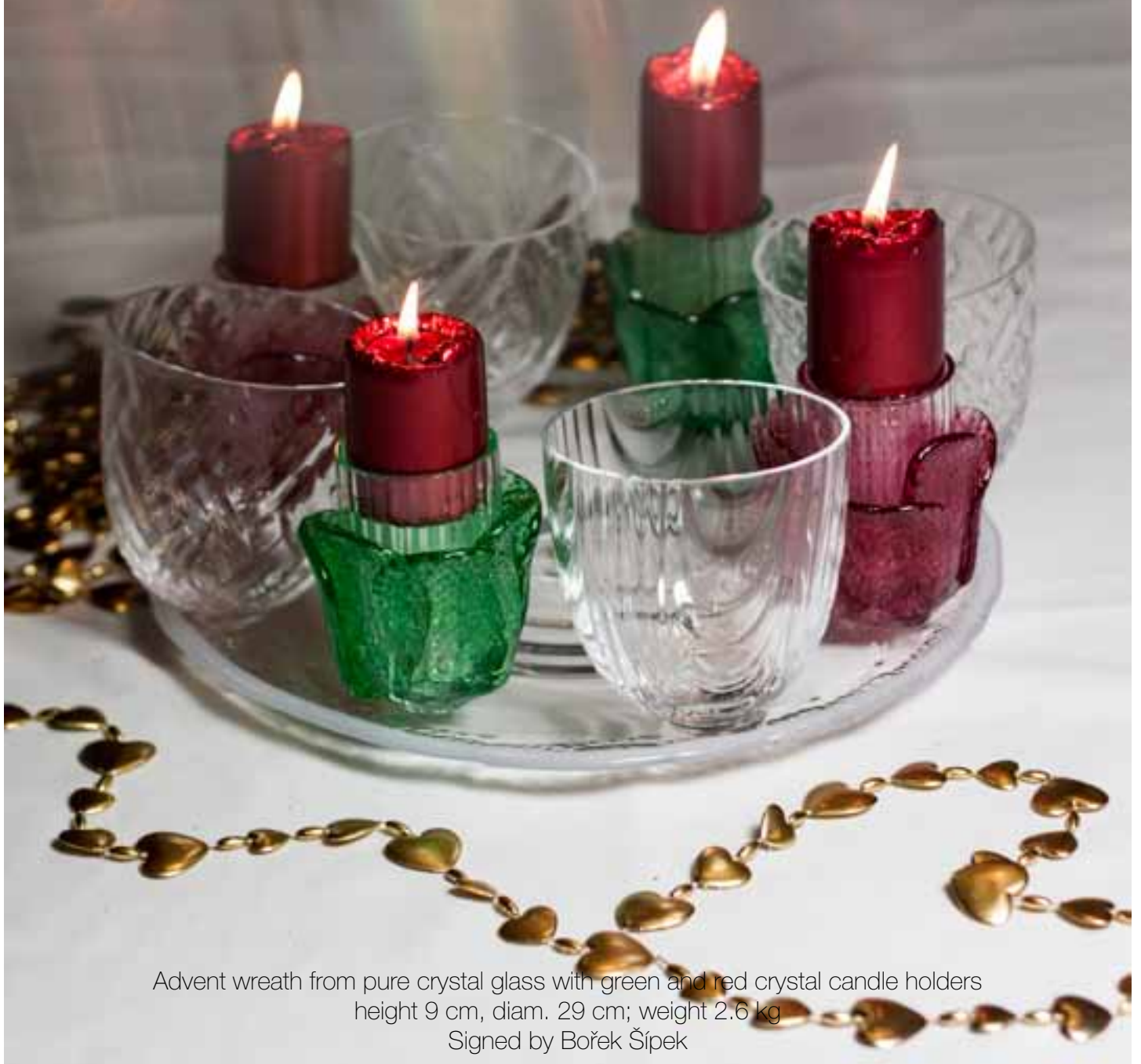
Advent wreath from pure crystal glass with green and red crystal candle holders height 9 cm, diam. 29 cm; weight 2.6 kg Signed by Bořek Šípek

C hristmas is the season of giving – give someone the pleasure of nourishment with this candlelit server decorated with the traditional colours of Christmas. Impending flavours are about to be encountered and enjoyed without reservation!